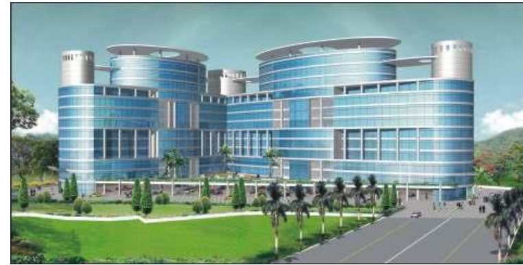
RELIABLE TECH PARK