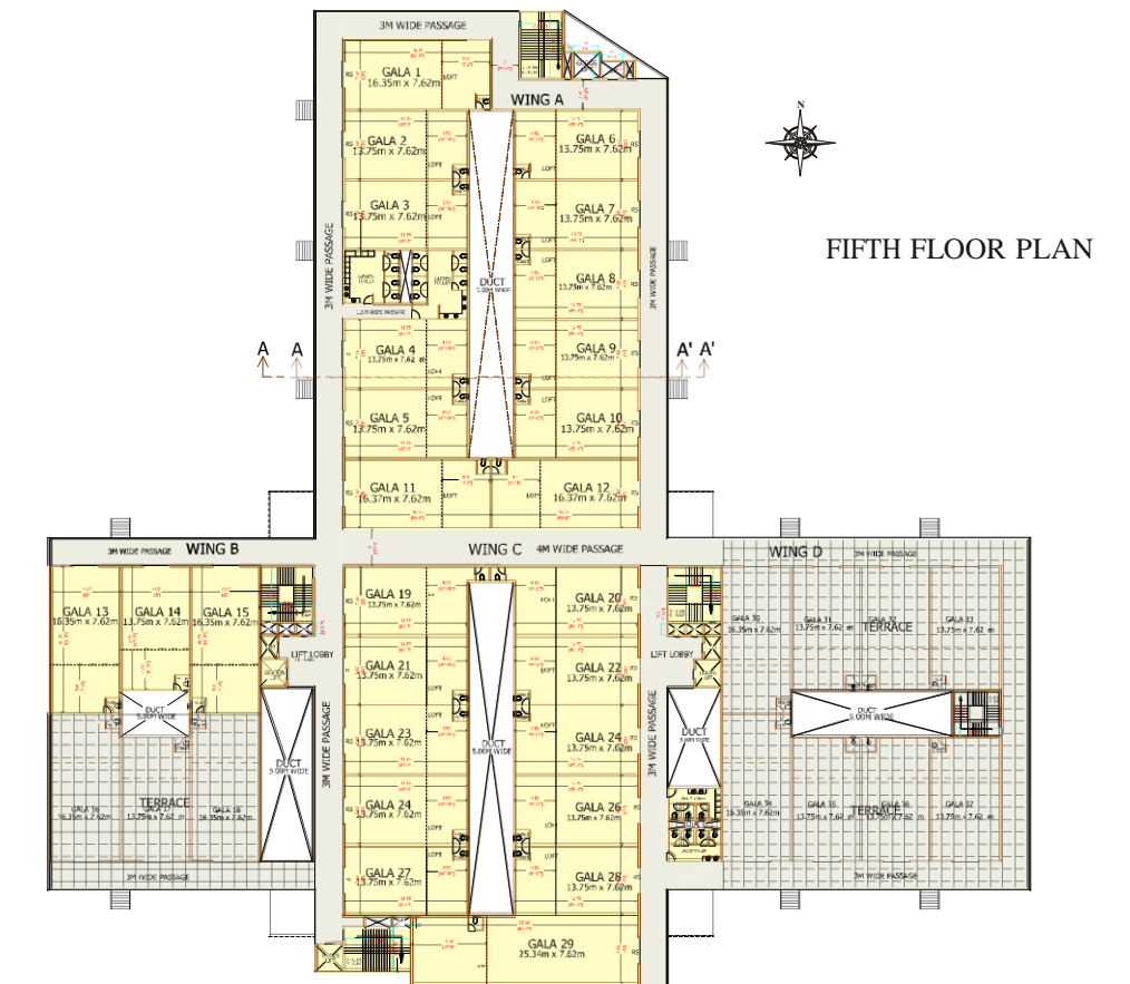
FIFTH FLOOR PLAN