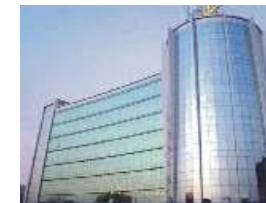
RELIABLE TECH SPACE